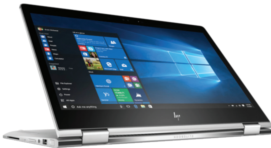
HP EliteBook x360 1030 G2 Notebook PC

Sehi Computer Products is an information technology solutions company focused on serving customers in K-12 educational environments. For the past 35 years Sehi Computer Products, an HP Gold Partner, has supported schools by providing educators with innovative classroom solutions that engage students and advance academic achievement.